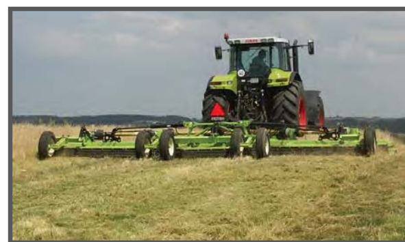
Superb Ground Following Characteristics

Over 26' of working width ensures that you get the big jobs done fast. The Schulte 5026 is designed to cut everything from light brush to crop residue such as corn stalks, wheat stubble and cotton stalks. Special blade sets are available to enhance chopping action. This machine is ideal for cutting crops like sweet clover for incorporation as green manure. The Schulte 5026 has adjustable wheel standards to fit easily into row crop spacings of 30" to 1 meter. With a maximum frame section width of 10' the Schulte 5026 does a good job of following uneven ground contours.