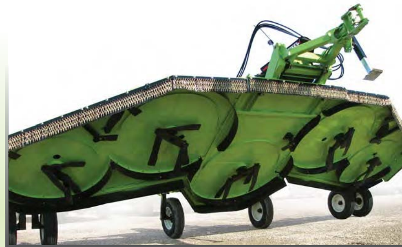
- Fixed Knife Unit Shown -