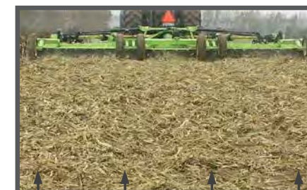
Pasture & CRP Maintenance