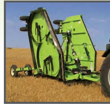
- Fixed Knife unit shown (Wings Up) -