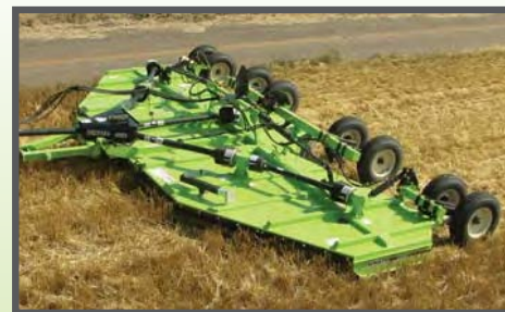
- Shredding Wheat Straw -