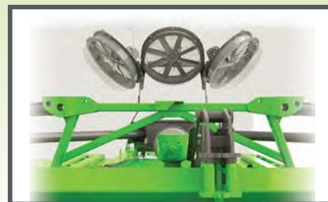
- Optional Deck Debris Fan Kit -