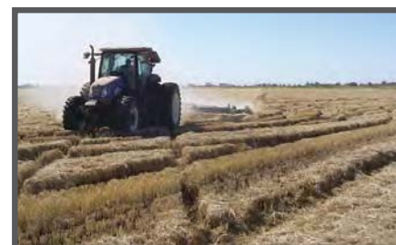
5026 In Rice

Decks include a 6' centre section and two 10' wings. This package provides a reasonable transport width (126") and height (148"). An extra wide centre section stance keeps the machine stable while it is being transported. A unique suspension system cushions the front hitch as well as the wheel standards without causing any side to side sway.