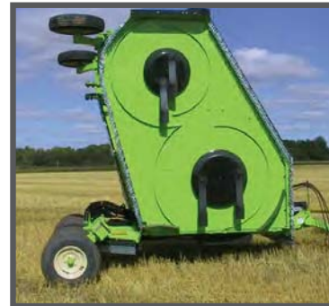
- Stump jumper unit shown (Wings Up) -