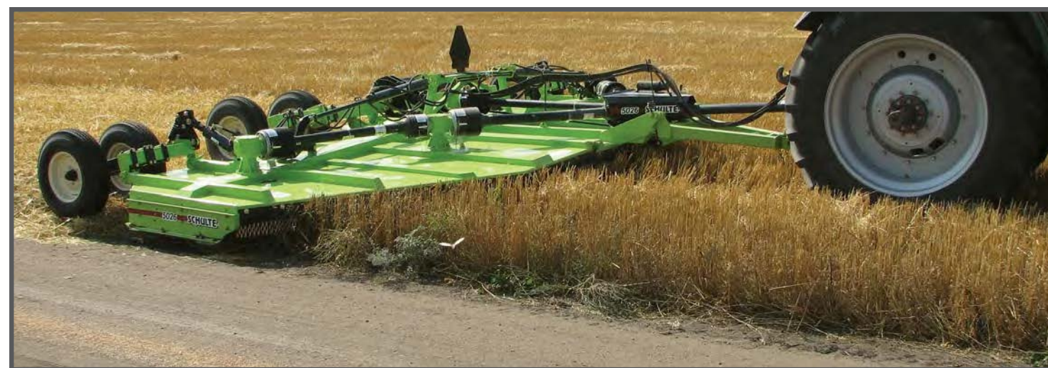
Excellent Shredding and Distribution